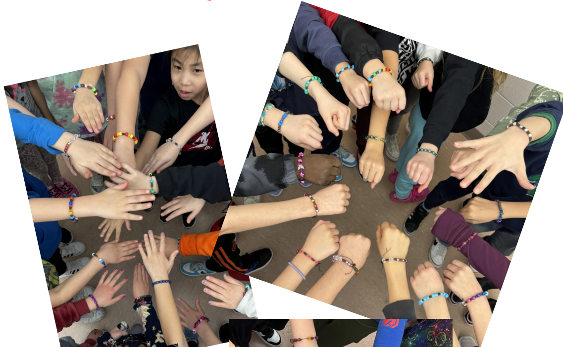
Wolf Willow bracelets @ Probe