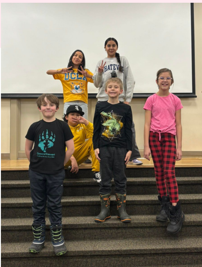
General Stewart Orange Shirt Day collaboration