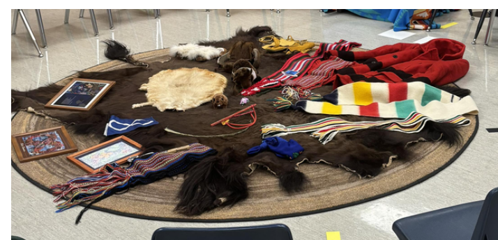
Carnival @ Agnes Davidson