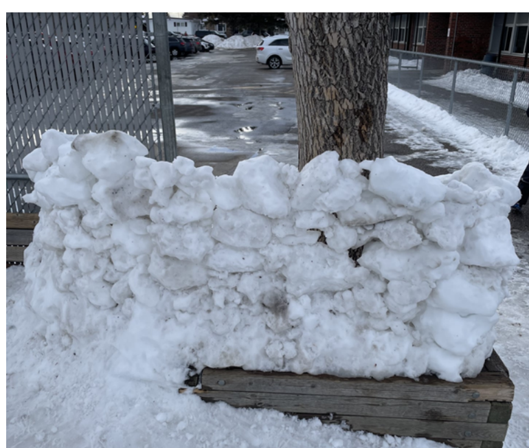
Agnes Davidson students built an igloo!