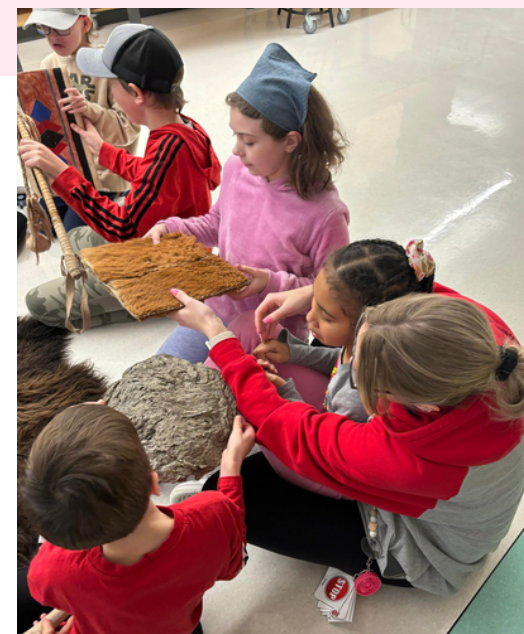
Buffalo Kit @ Plaxton