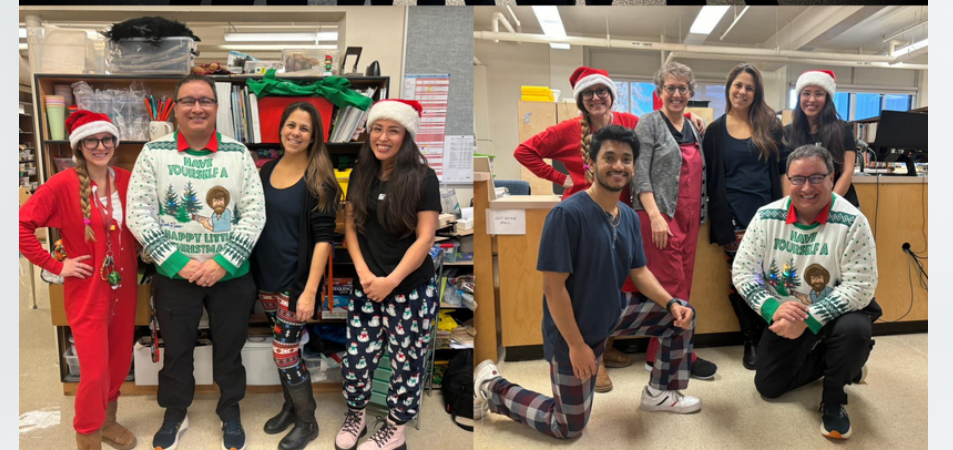
Holiday Wishes from the Indigenous Ed Team and the CRC