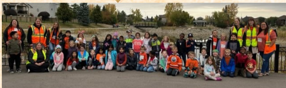
Grade 1 Run for Reconciliation @ Park Meadows

Fleetwood Bawden celebrated National Day of Truth and Reconciliation and the start of the year with a school smudge. Students in Grade 3/4 also participated in making Faceless Dolls.