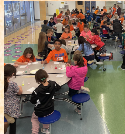
Circle of Courage @ Buchanan