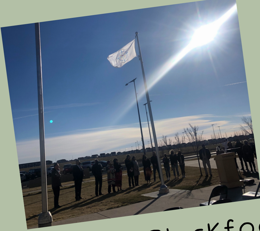
Chinook Blackfoot Flag Raising