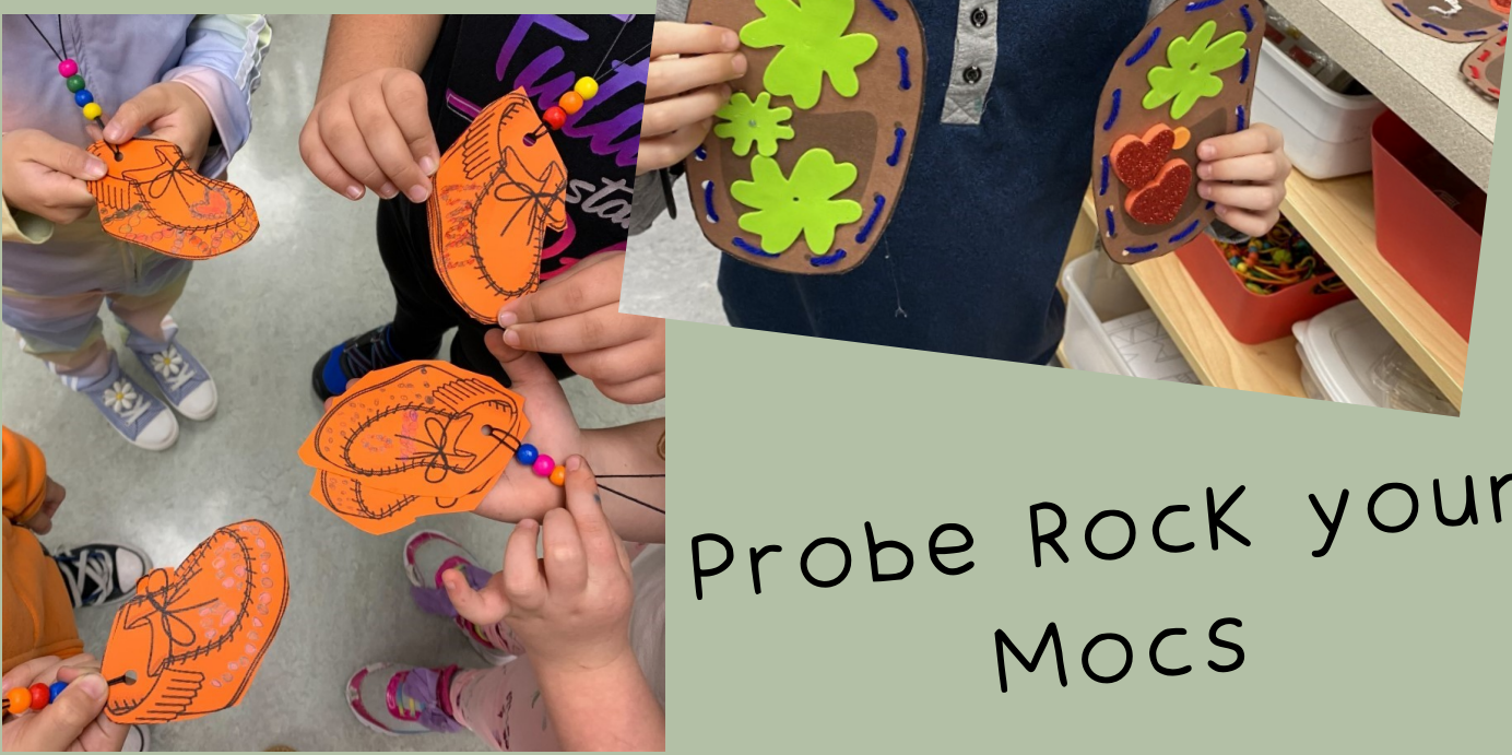
Probe Rock your Mocs