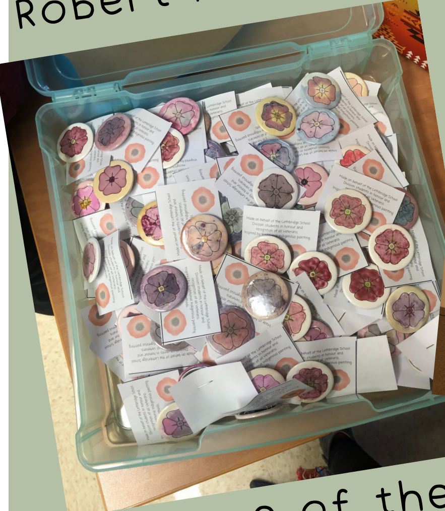
Some of the poppies donated to the Legion