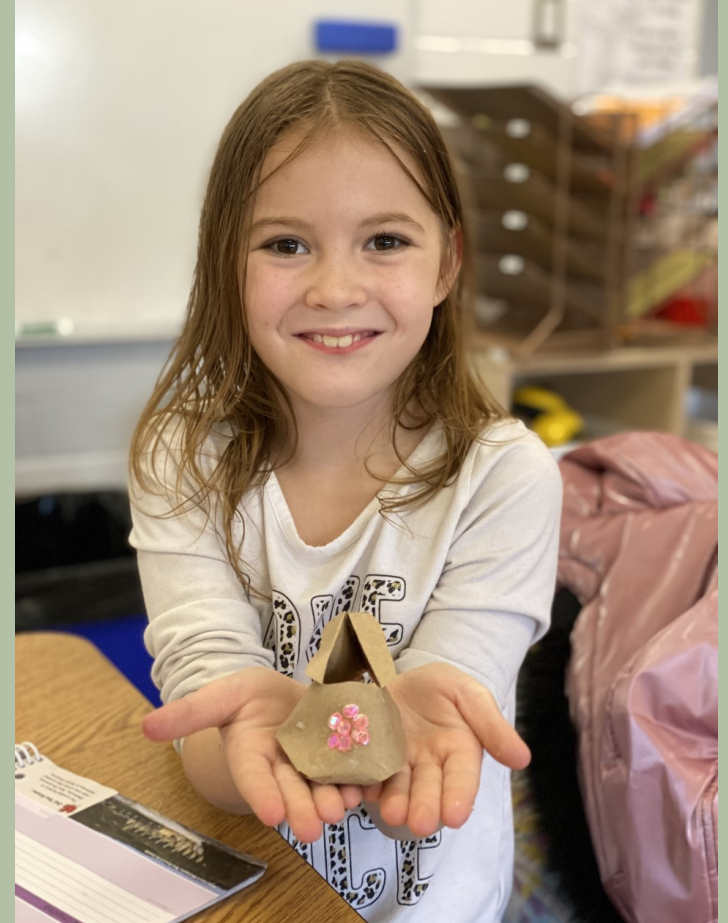
Buchanan Rock your Mocs