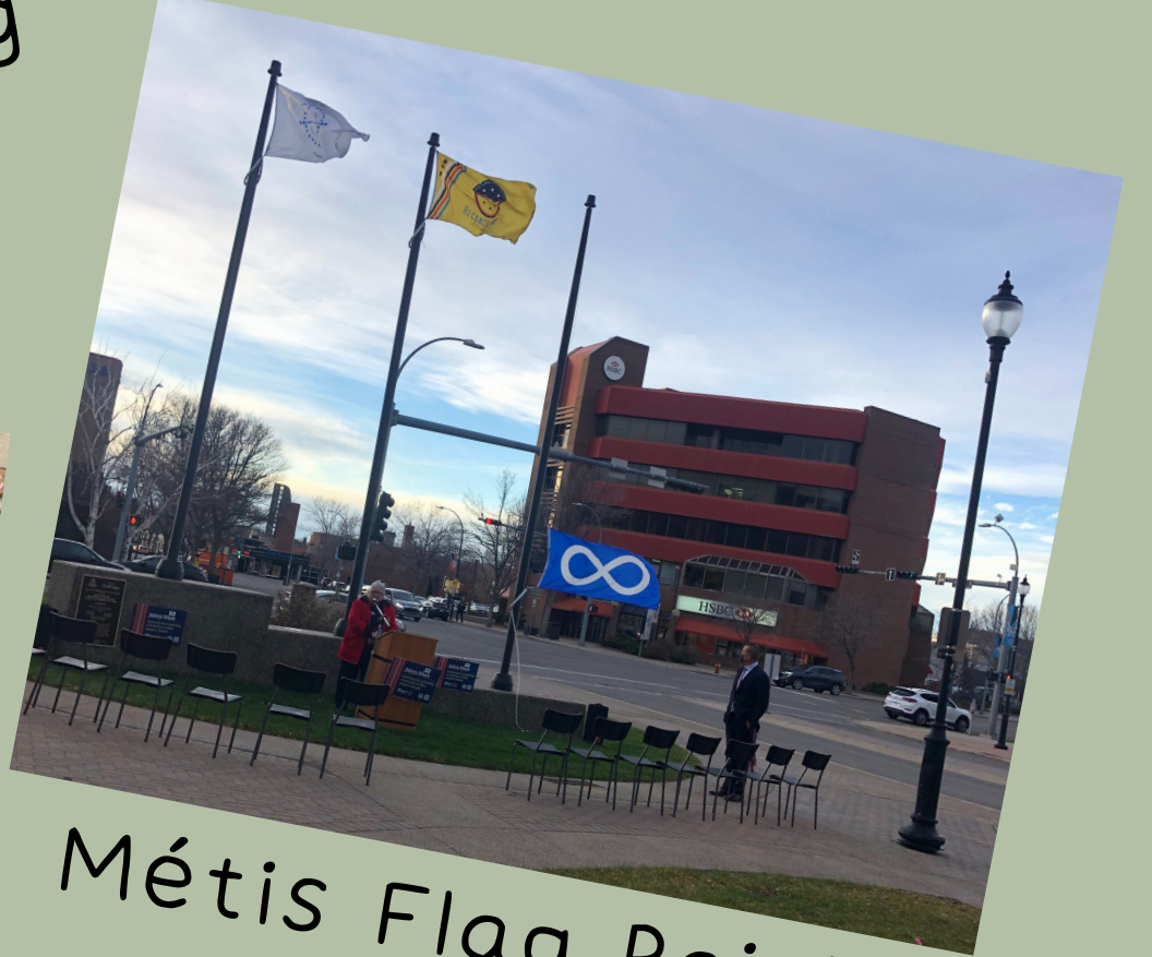
Métis Flag Raising